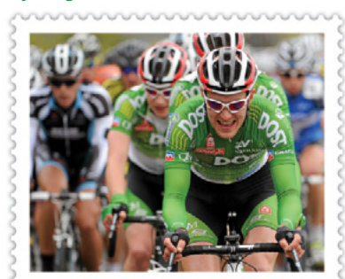
Éire 72C Rothaíocht & VELING