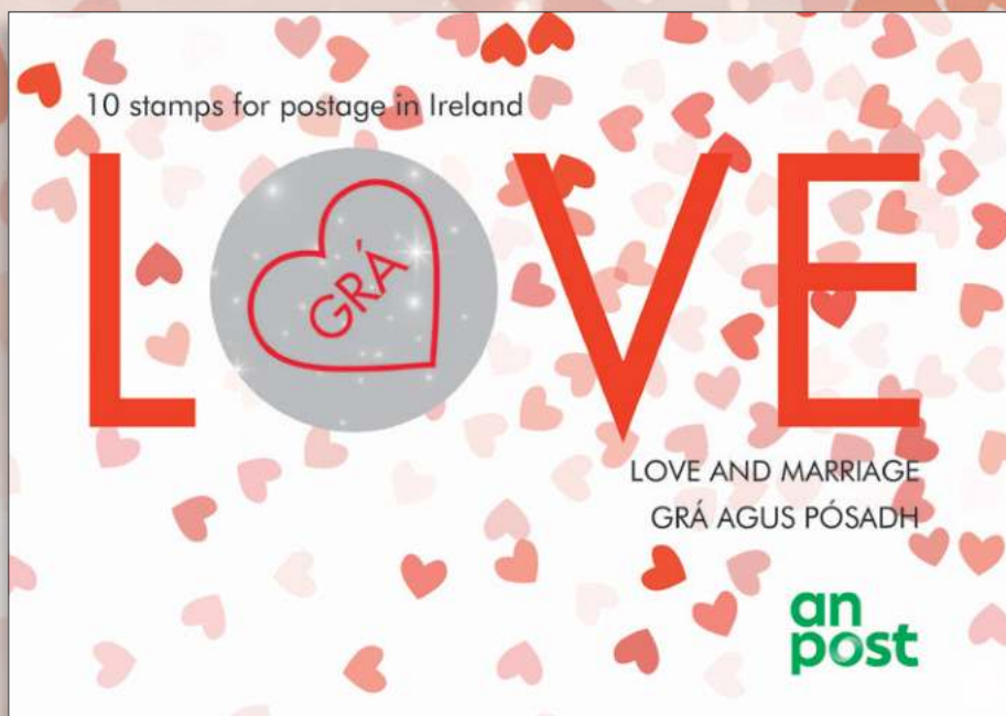
LOVE AND MARRIAGE BOOKLET Code 2103BK Price €10.00