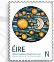
DISESTABLISHMENT OF THE CHURCH OF IRELAND 'N' RATE STAMP Code 2101N Price €1.00

The disestablishment of the Church of Ireland led to its transition from being a privileged minority to being a confident and influential minority down through the years.