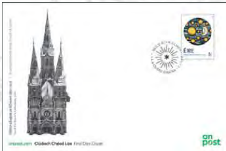
DISESTABLISHMENT OF THE CHURCH OF IRELAND FDC Code 2101FDC Price €2.50

January 1, 2021 marks the 150th anniversary of the disestablishment of the Church of Ireland, resulting in the dissolving of the union between Church and State in Ireland that had existed since the 16th century Reformation. We mark this important milestone by issuing a special stamp on January 7.